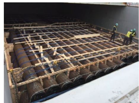
Clad steel pipe shipment

As a leading company in clad steel pipes for natural gas pipelines, we will continue focusing on attracting orders for new projects.